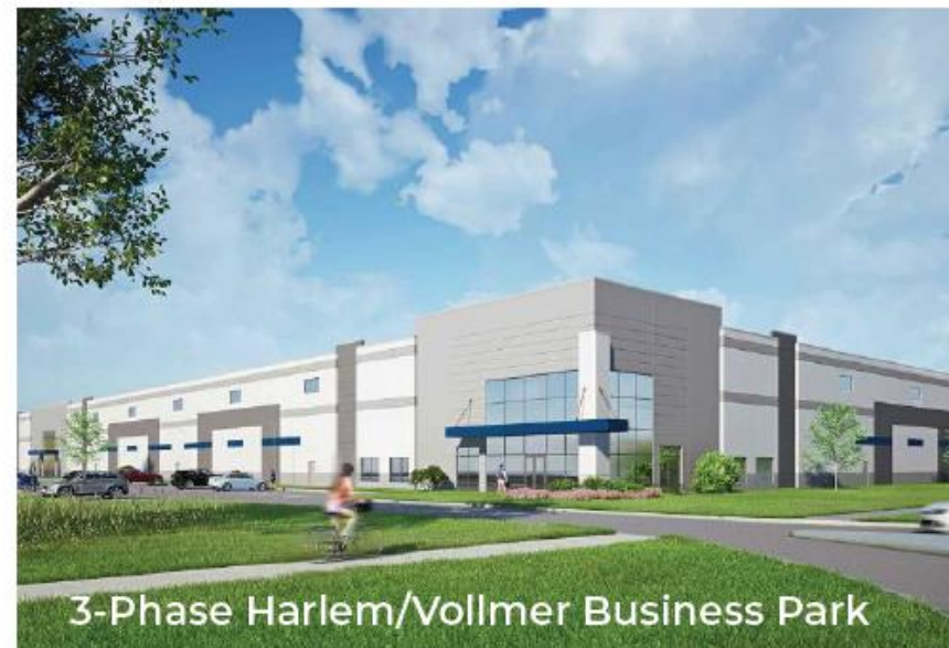
3-Phase Harlem/Vollmer Business Park