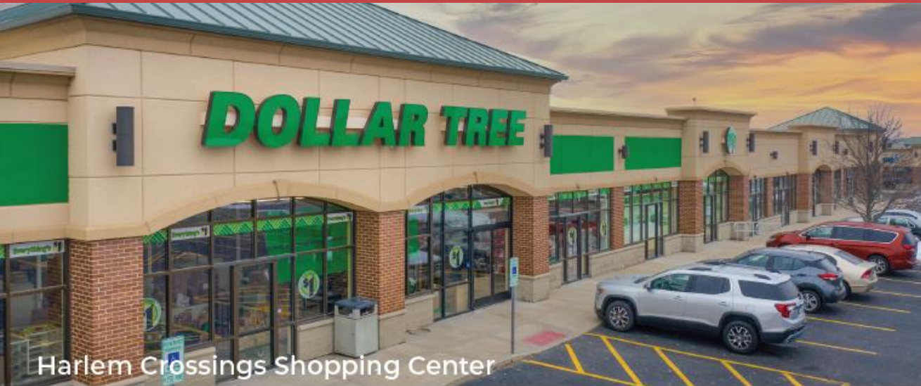
Harlem Crossings Shopping Center