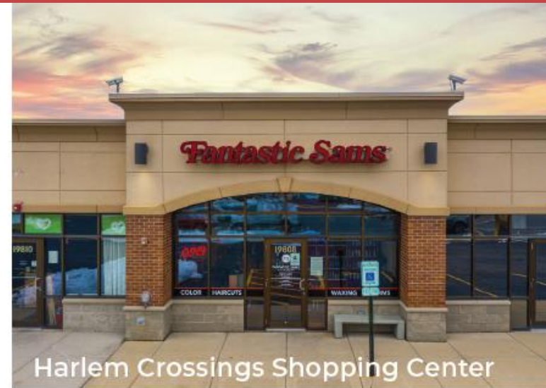
Harlem Crossings Shopping Center