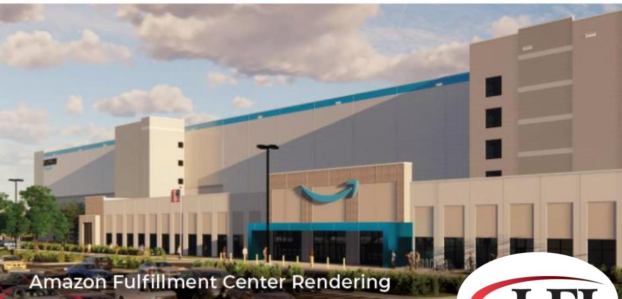
Amazon Fulfillment Center Rendering